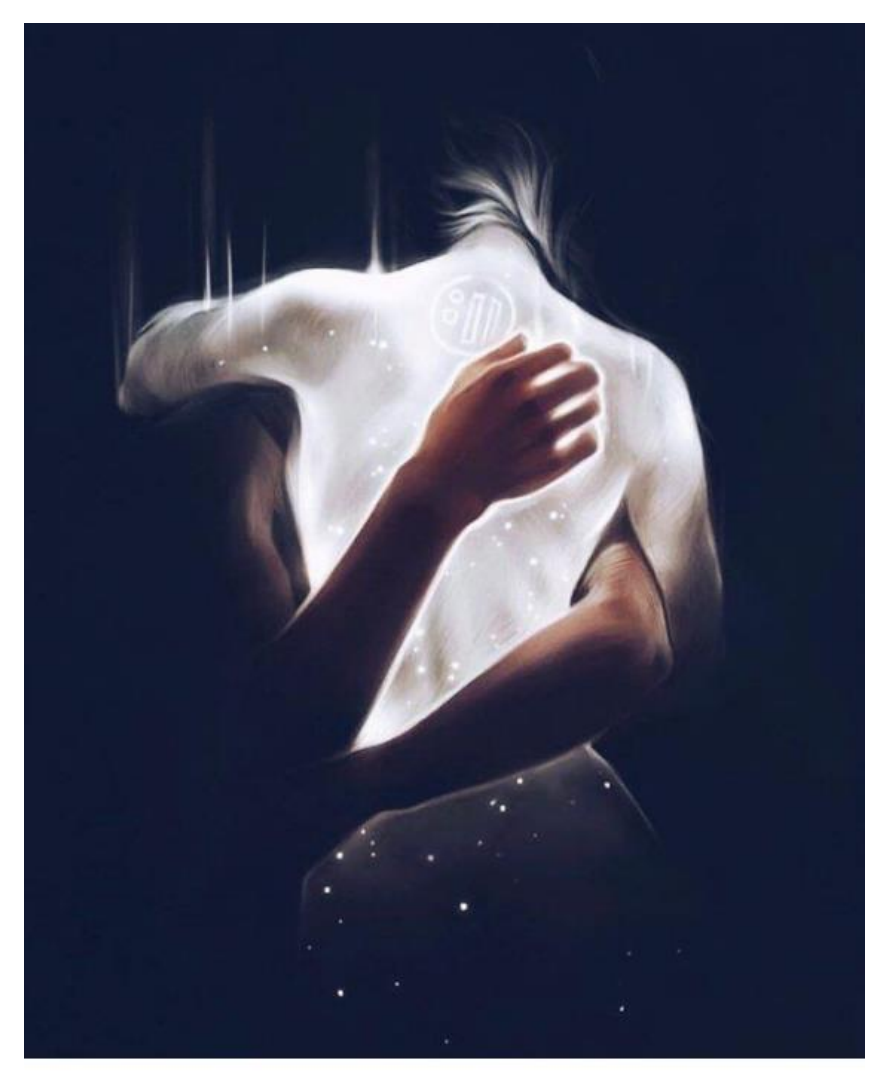
Pure Fusion. Love. Emotion.

Thus, upon their sanction, the next phase of my existence commenced in a dwell perched high on the peaks of the Redenum mountains.