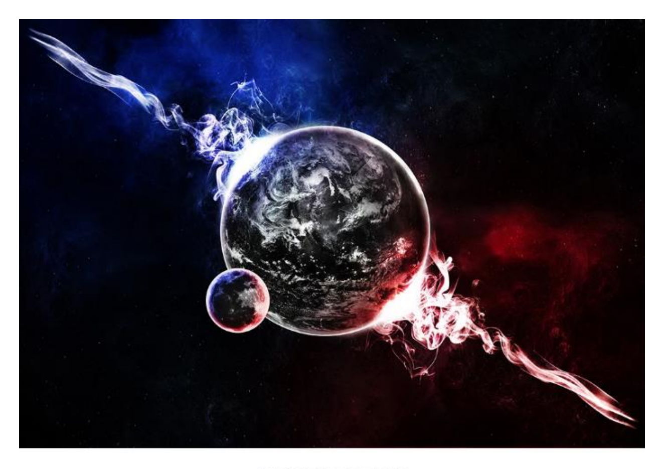
But what of good and evil?

"The ideal for a harmonic existence shall come to pass when all is in balance...dark and light, passive and aggressive, female and male. But what of good and evil? Are they beyond the reach of harmony?"