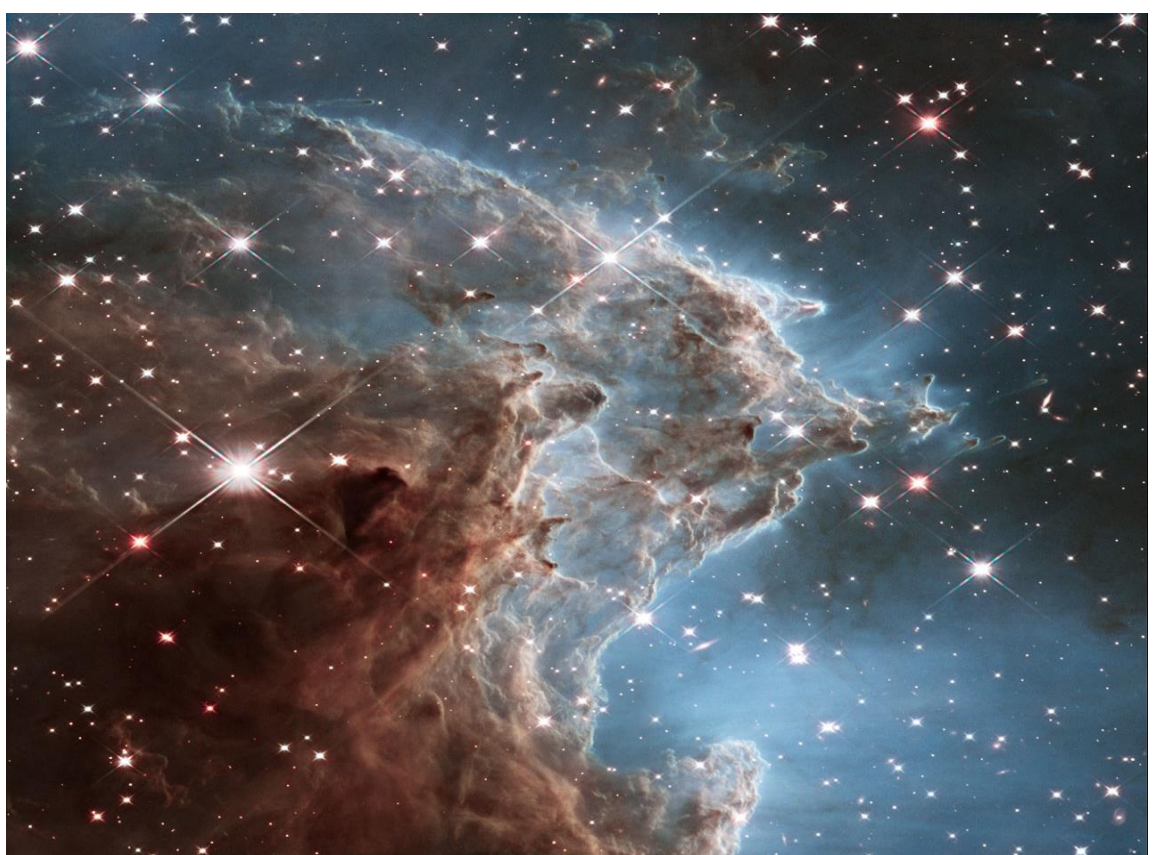
The Talderon Era emerged

"It is done, Master. Your copious cycles of contemplation yielded profound wisdoms that elevated my spirit to such a degree that I joined with Ousía. The Eternal Light shines upon you in profound recognition. A new era is to commence, and it shall be known as the Talderon Era. It has been decreed thus."