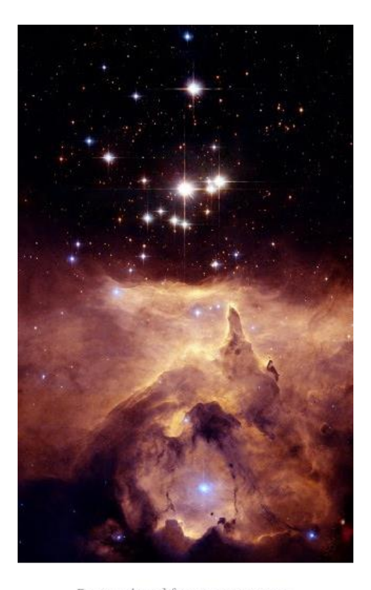
Peace reigned for over 500 years.

Under this philosophy, spiritual, social, and political stability spread throughout most of the known universe over the ensuing five centuries.