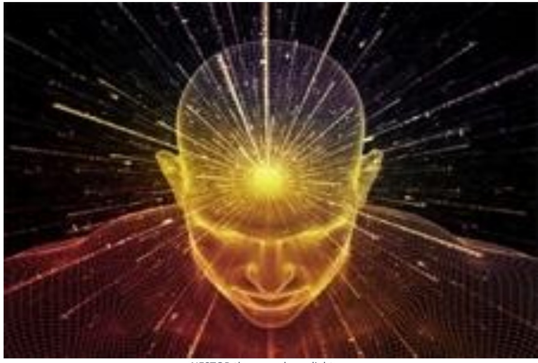
NESTOR the one who enlightens

Eriandan Harlaren was born on the planet Ziud, in the galactic cluster of Ontah. Eriadan possessed the most extraordinary mental powers, gifts that only the stars could have bestowed upon him. His young journey had resulted in the discovery of the HallandaHall Scrolls, and the eventual creation of the Talderon Ideals . The Fellowship anointed him NESTOR, based on the mythological being whose name meant "the one who enlightens" and, as ordained by the stars, he became the indisputable moral and spiritual guide for the known civilizations.